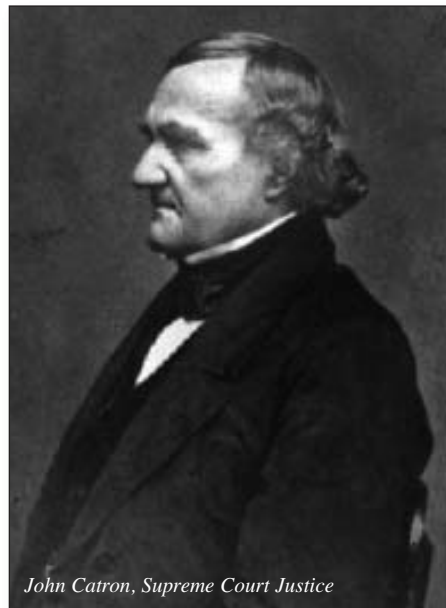
John Catron, Supreme Court Justice

In those days attorneys and judges rode together in a pack from one venue to another. Travel from one county to the next began on Sunday. Catron noted that "Each man was well appointed, carried pistols and holsters, and a negro....The pistols were carried...to fight each other...furnishing an occasion for a duel,