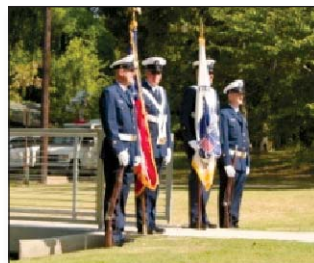
U.S. Coast Guard Color Guard presents colors.