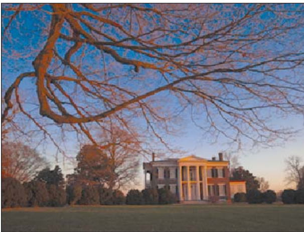
Robin Hood, Rippavilla , 2010

as well as historic districts and zoning issues. TPT has a committed staff, an active board of directors, and many dedicated volunteers throughout Tennessee. For more information please visit: www.tennesseepreservationtrust.org