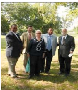
Formal welcoming committee.