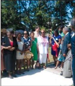
Friends and relatives participate in informal ribbon cutting ceremony.

On August 13th, a gathering of dignitaries joined with the family and friends of renowned author Alex Haley and others to celebrate the long-awaited opening of a new first-class visitor center and museum in Henning adjacent to his boyhood home. Funded by the State of Tennessee, the visitor center, designed by Askew Nixon Ferguson Architects of Memphis, has received four awards for its design, including one for the AIA-Gulf States, and AIA Tennessee. Although construction on the visitor center has been complete for some time, new exhibits, at a