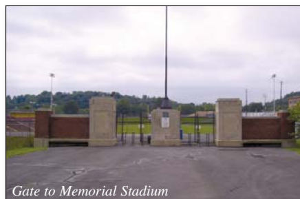
Gate to Memorial Stadium