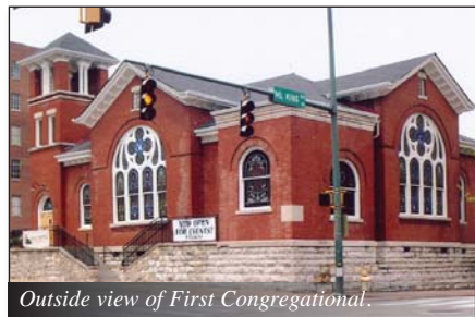
Outside view of First Congregational.